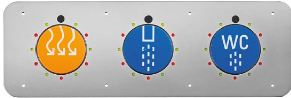
CK Touchless Panel for lavatories